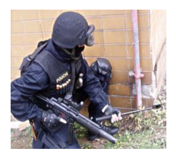
The variants M - 2 - 18 and M - 3 - 18 have been designed for use on the batons with tube diameter 18 mm,